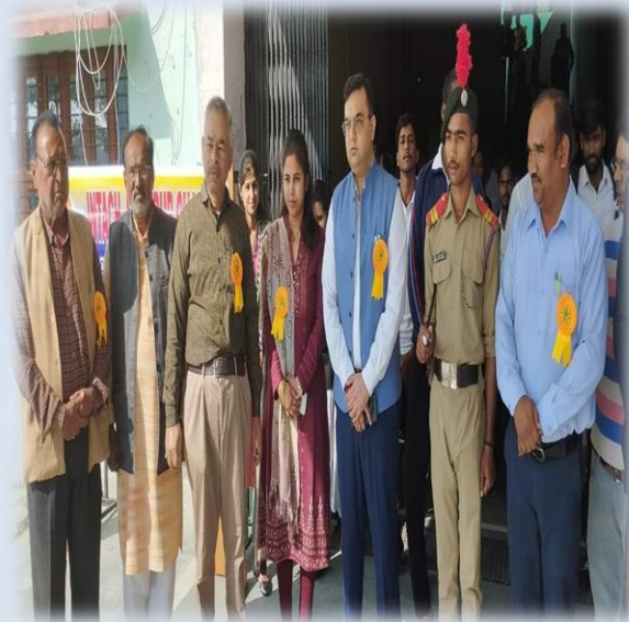
Pahalwan Gurudeen Mahavidyalay